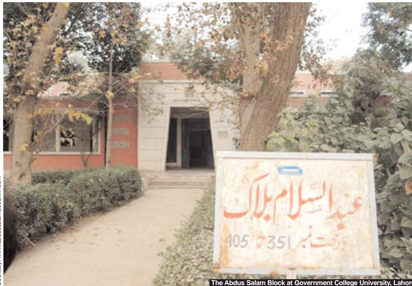
The Abdus Salam Block at Government College University, Lahore

In 1964, Salam set up the International Centre for Theoretical Physics in Trieste, Italy. He had initially wanted to set up the centre in