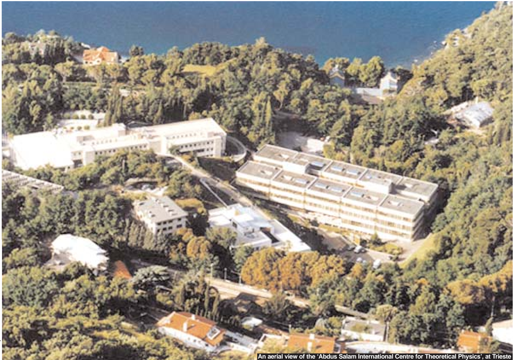
An aerial view of the 'Abdus Salam International Centre for Theoretical Physics', at Trieste