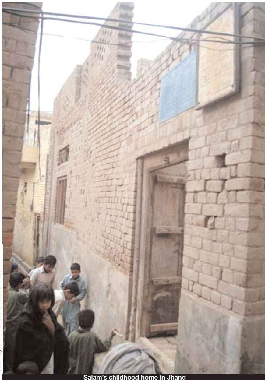
Salam's childhood home in Jhang